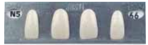
N5 Centrals 7.6x12.9 Laterals 5.9x12.3