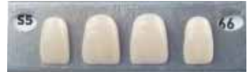
S5 Centrals 9.6x12.6 Laterals 7.3x12.0