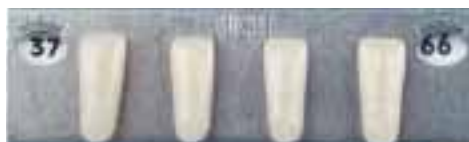
37 Centrals 5.7x14.0 Laterals 6.1x14.5