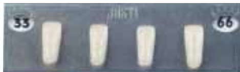
33 Centrals 4.6x10.7 Laterals 4.9x11.0