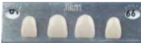
UI Centrals 8.6x9.9 Laterals 6.9x9.7