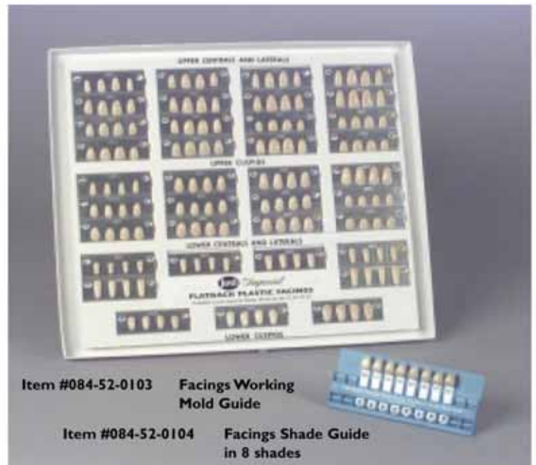
Item #084-52-0103 Facings Working Mold Guide

Only a limited amount of tooth structure can be removed from the incisal so any alteration of the incisal should be accomplished before the Facing is fit to the edentulous ridge. After the Facing has been closely ground to the ridge, coat the model with a soft lead pencil. This will mark and