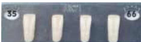
35 Centrals 4.8x12.1 Laterals 5.2x12.5