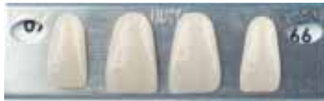
07 Centrals 9.5x15.2 Laterals 7.2x14.1