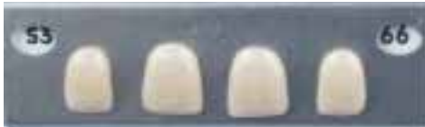
S3 Centrals 8.6x10.2 Laterals 6.9x9.1