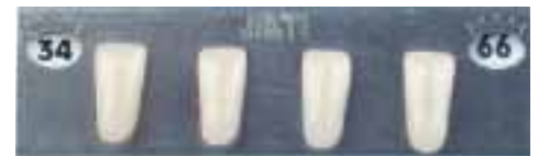
34 Centrals 5.7x11.8 Laterals 6.0x12.0