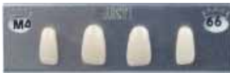
M4 Centrals 6.4x10.6 Laterals 4.8x10.0