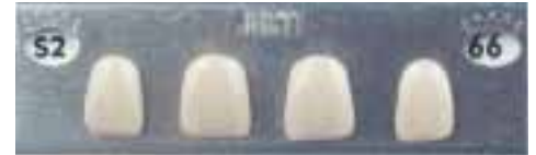
S2 Centrals 8.2x9.9 Laterals 6.7x9.6