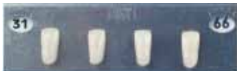
31 Centrals 4.4x9.4 Laterals 4.6x9.5