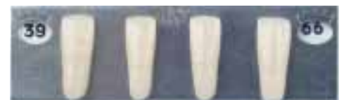
39 Centrals 5.7x15.7 Laterals 6.2x15.9