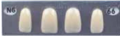
N6 Centrals 8.5x13.6 Laterals 6.6x13.0