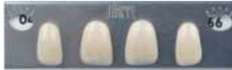
04 Centrals 8.5x12.2 Laterals 6.7x11.4