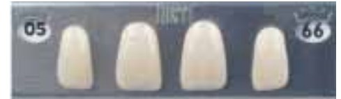
05 Centrals 8.6x13.2 Laterals 6.6x12.1