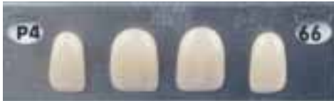
P4 Centrals 8.6x11.5 Laterals 6.5x11.2