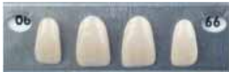
06 Centrals 9.0x13.7 Laterals 6.8x12.5