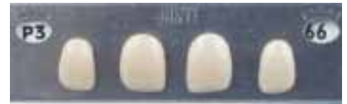
P3 Centrals 8.1x10.9 Laterals 6.4x9.9