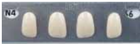
N4 Centrals 7.7x11.9 Laterals 6.3x11.2