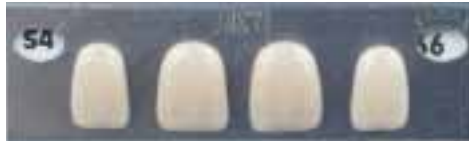
S4 Centrals 9.2x11.7 Laterals 7.4x11.2