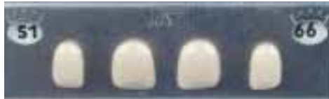
S1 Centrals 7.9x9.2 Laterals 5.7x8.7